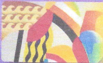
CID REYES | Aton Wave Series 16, 2020

DIVE INTO THE UPDATED FRAMEWORK TO ENHANCE GENDER MAINSTREAMING AND GENDER-RESPONSIVE PLANNING, IMPLEMENTATION, AND EVALUATION