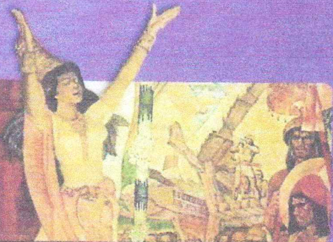
BOTONG FRANCISCO | Pag-unlad ng Panagagamot sa Pilipinas, 1933 | Photo from the National Museum of the Philippines

EXPLORE HISTORICAL PERSPECTIVES ON GENDER AND HOW THESE INFORM CONTEMPORARY GAD POLICIES AND PRACTICES